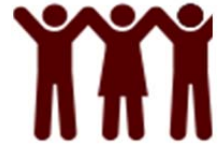
Celebration

As there were no other new business items, the meeting was adjourned.